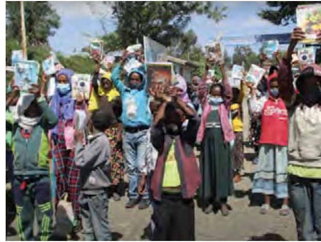
Children of HIV positive parents received school supplies during the COVID-19 pandemic.

Find more testimonials at FriendsofPAAV.org/testimonials.php