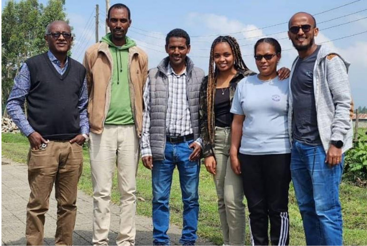
The PAAV Team